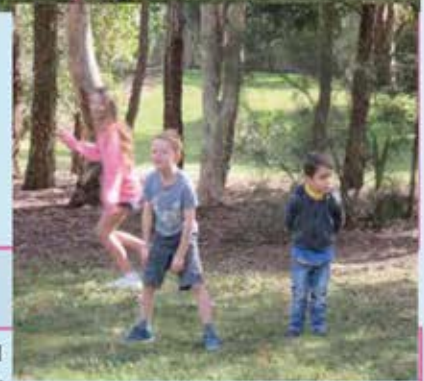
Newcastle DFK had a fun day - learning and playing together - thanks to their dedicated leaders - and developing the theme "NEW START"